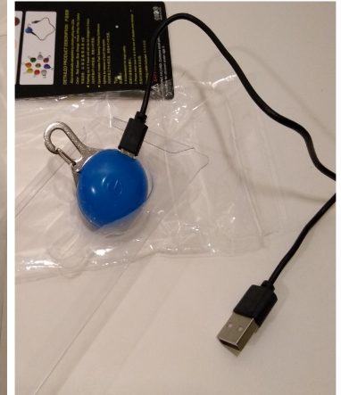
Plug small end of USB charging cord into the ball, larger end into computer or power strip USB port