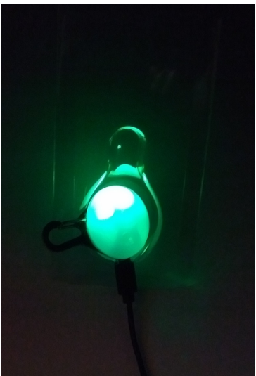
Ball light will turn GREEN when fully charged.