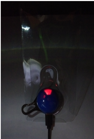
Ball will display RED light while charging.