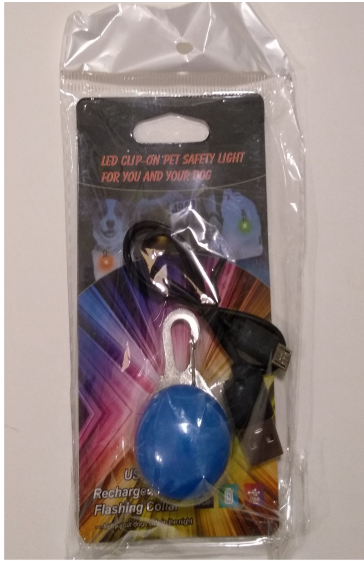
BE SEEN USB Rechargeable LED Pendant Safety Light