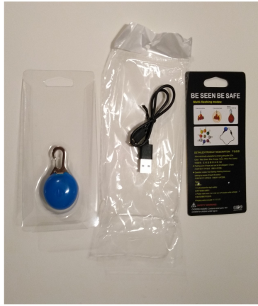
Unpack: Unseal sticky end, remove contents