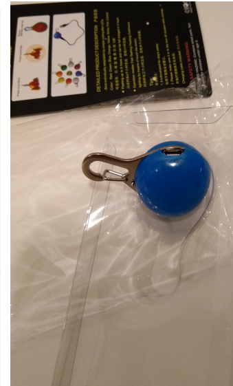
While holding the ball, slide the metal hook to fully expose the USB port