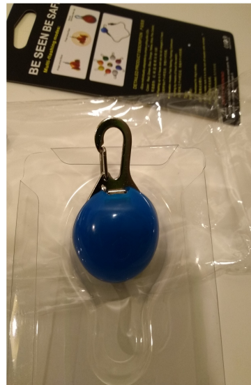
USB Port is in safety position under the hook/clasp portion.