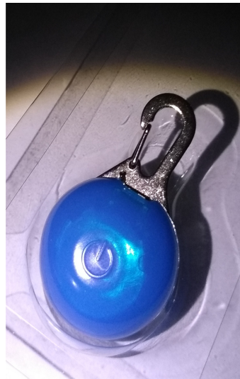
Power button is in center of the back of ball.