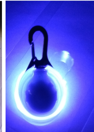
Press once for fast flash Twice for slow flash Three times for steady light.